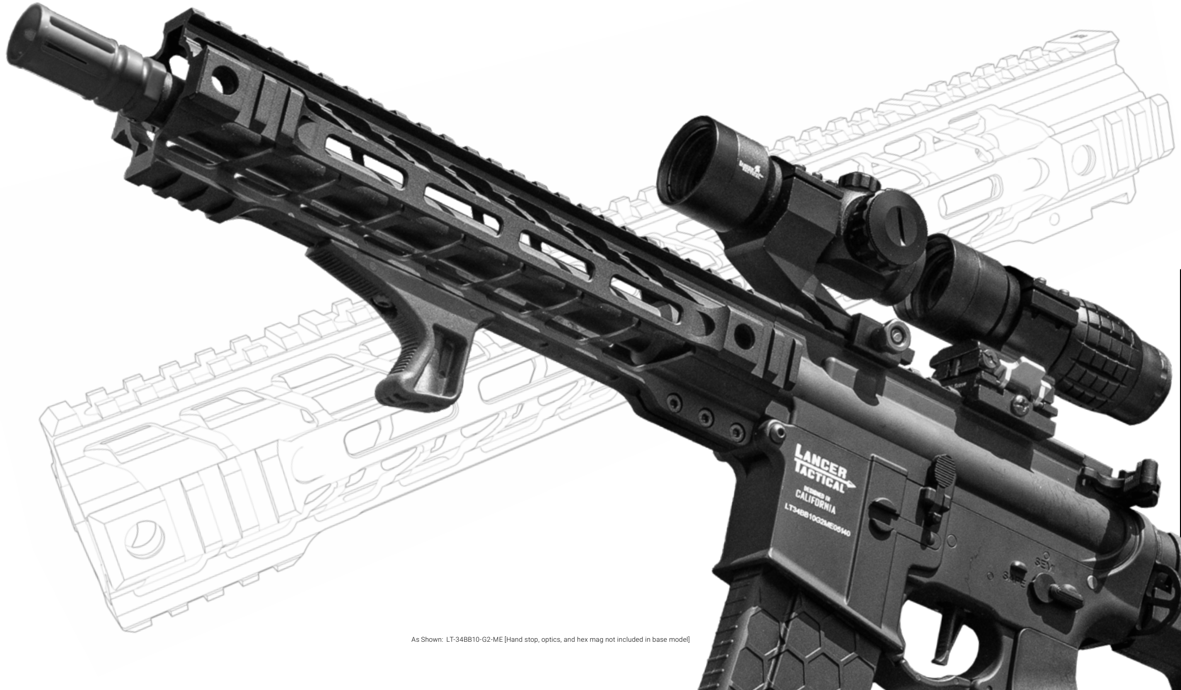
As Shown: LT-34BB10-G2-ME [Hand stop, optics, and hex mag not included in base model]