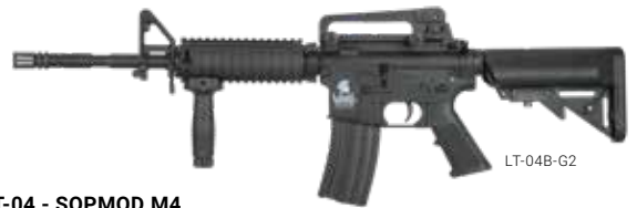
LT-04 - SOPMOD M4