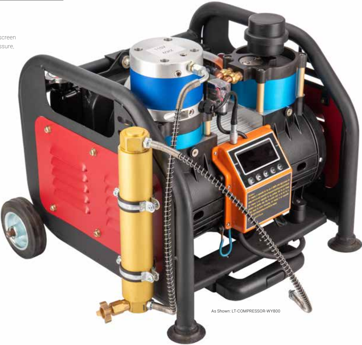
As Shown: LT-COMPRESSOR-WY800