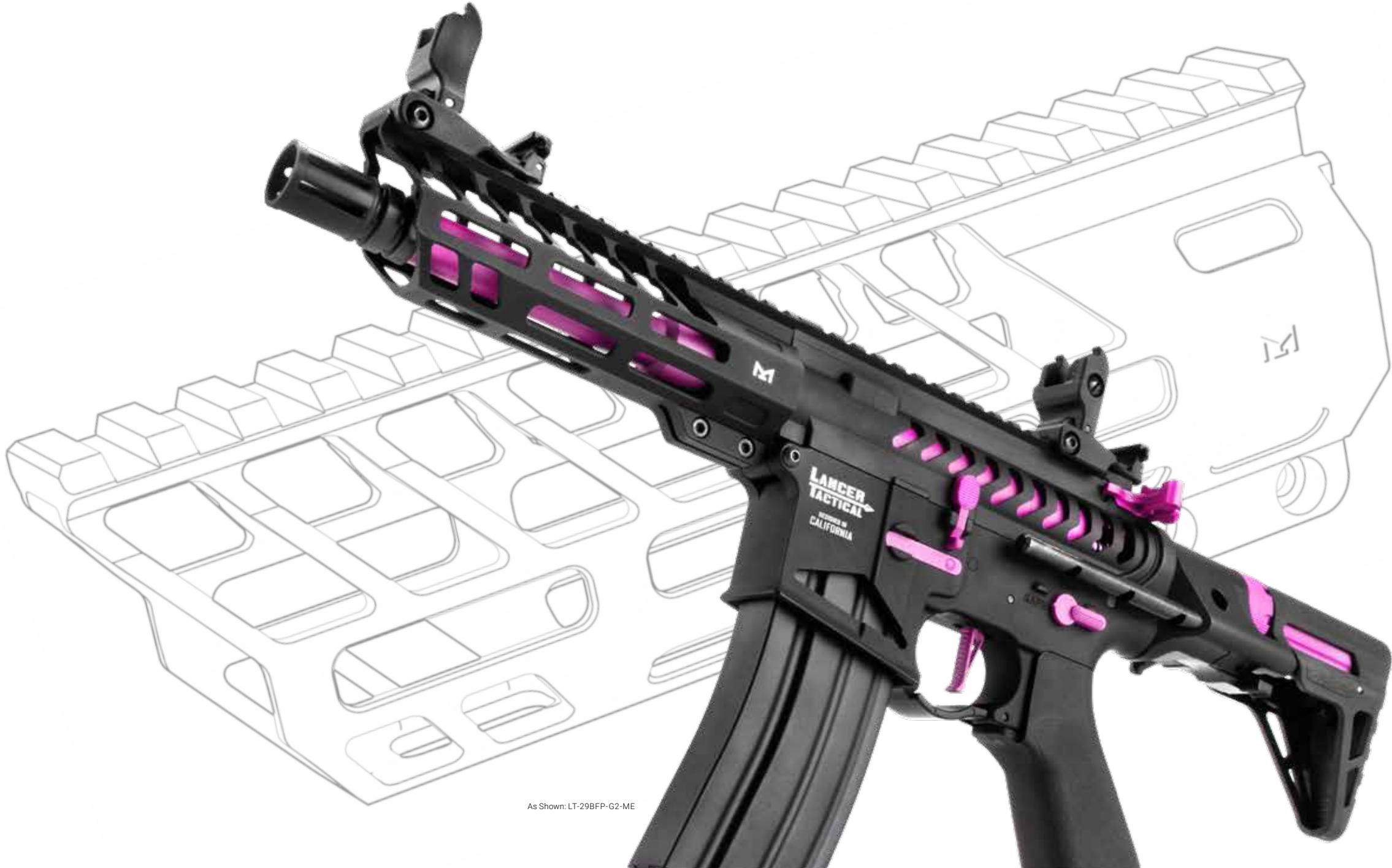
As Shown: LT-29BFP-G2-ME