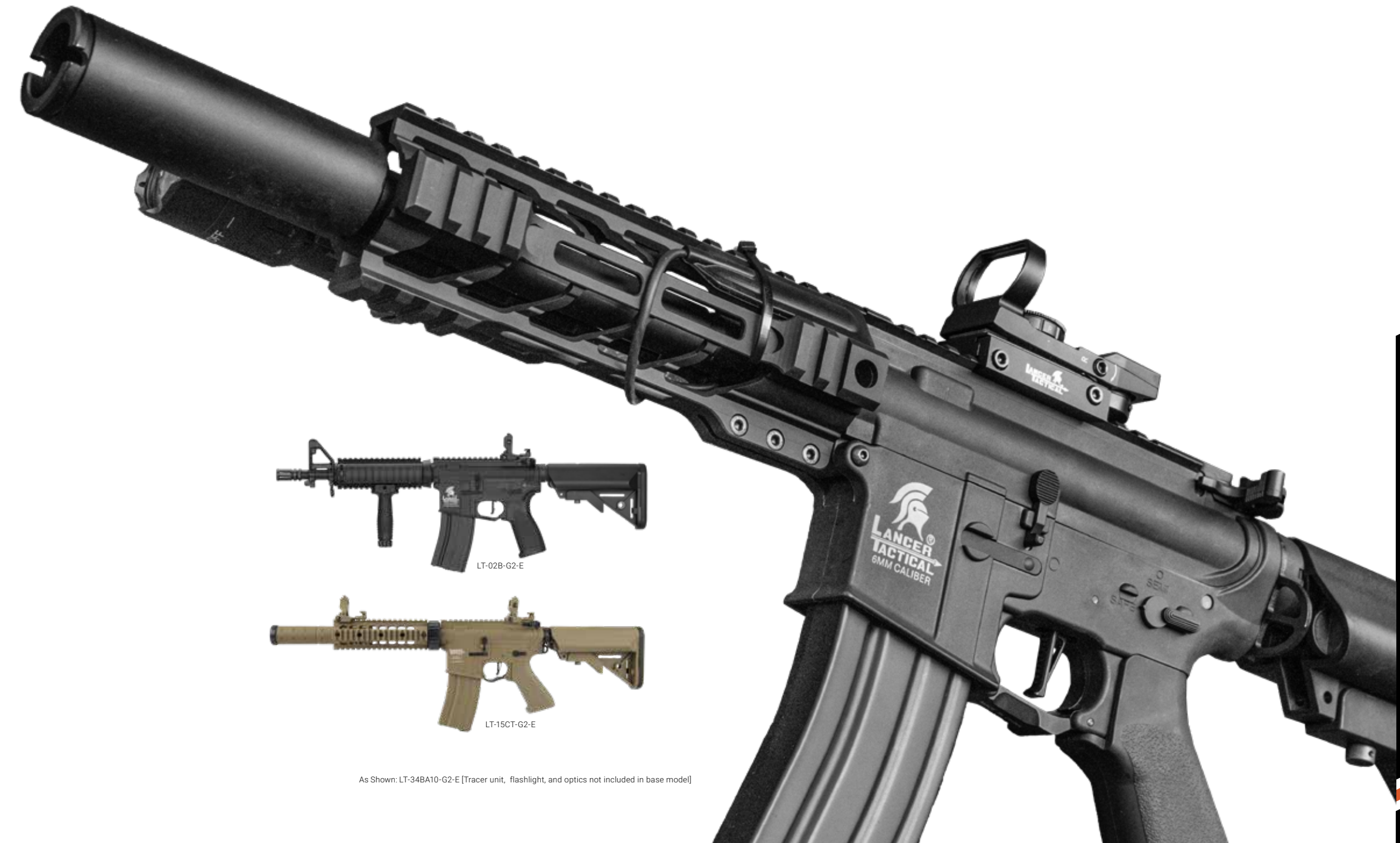
As Shown: LT-34BA10-G2-E [Tracer unit, flashlight, and optics not included in base model]