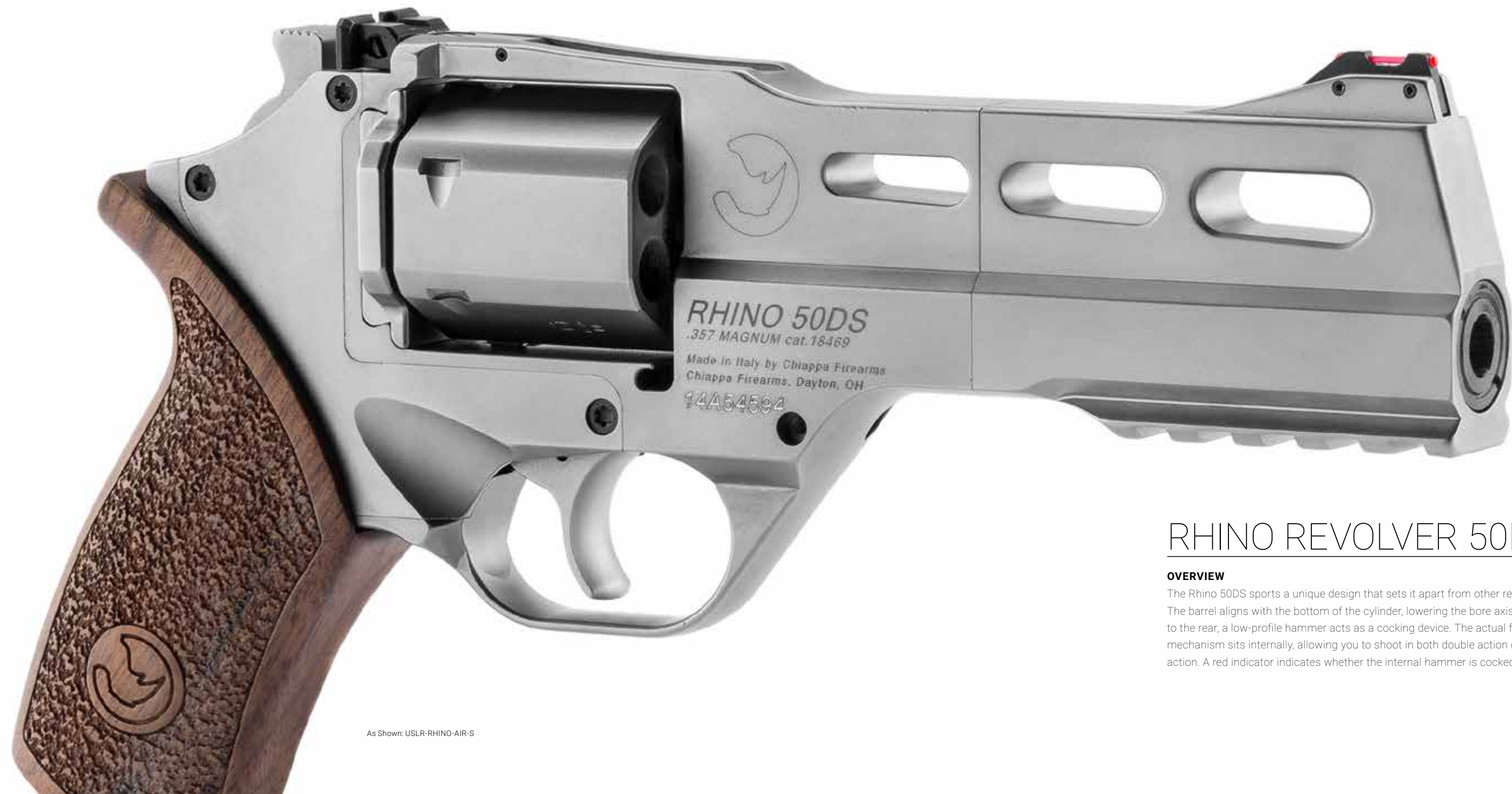
As Shown: USLR-RHINO-AIR-S