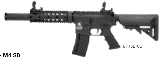
LT-15 - M4 SD