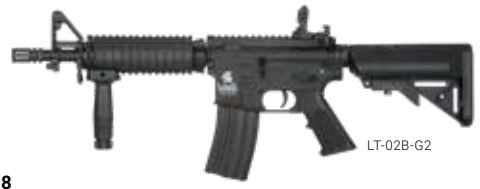
LT-02 - MK18