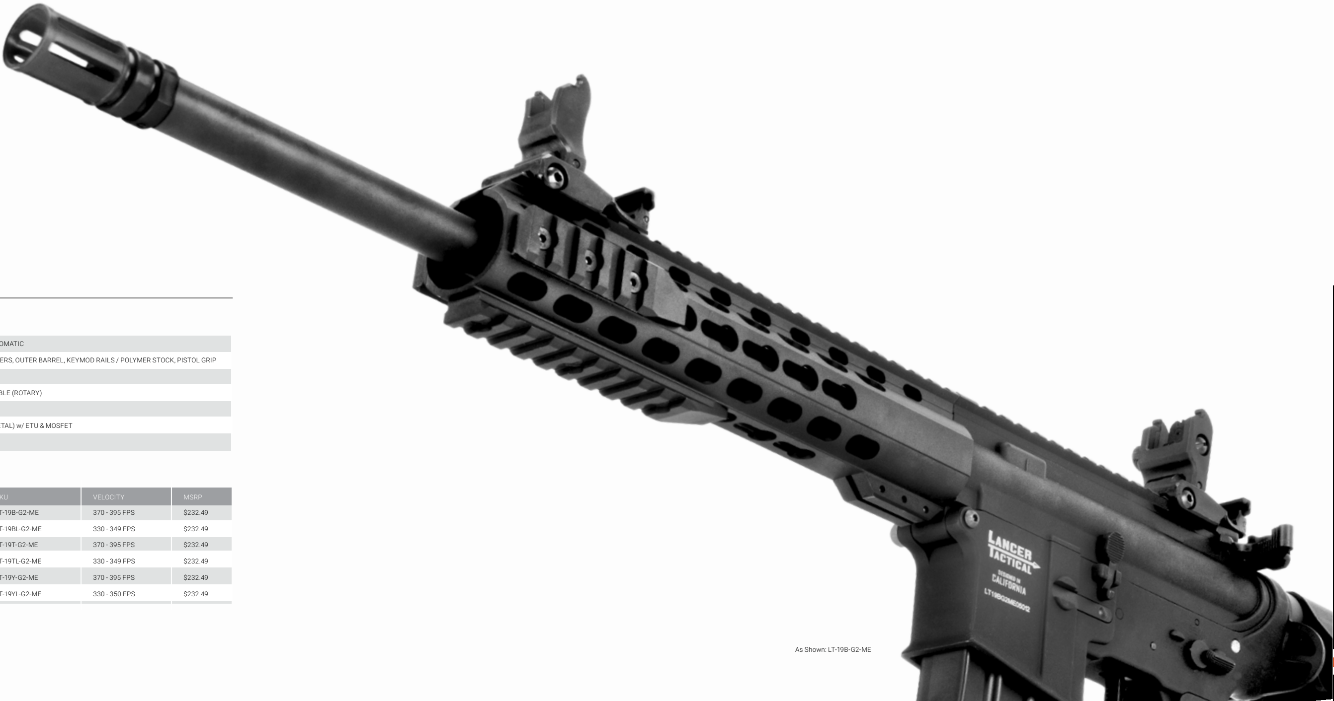
As Shown: LT-19B-G2-ME