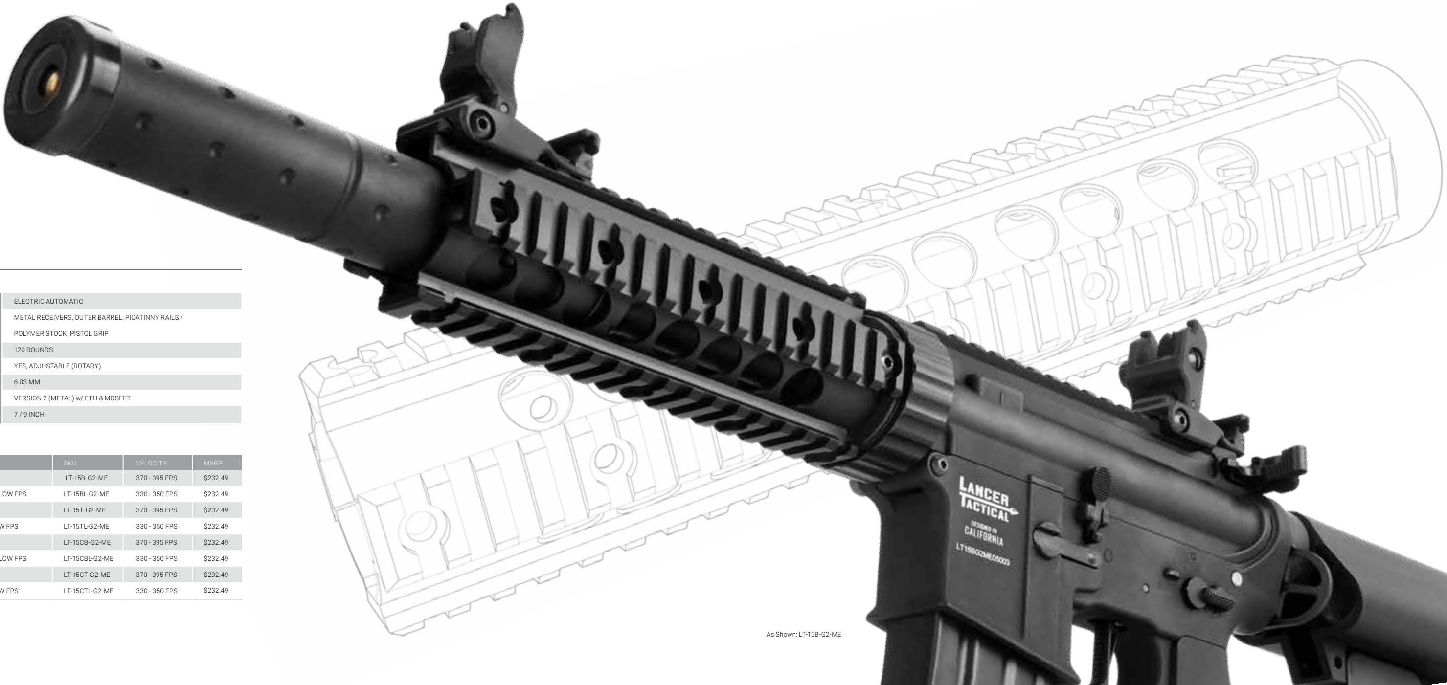
As Shown: LT-15B-G2-ME