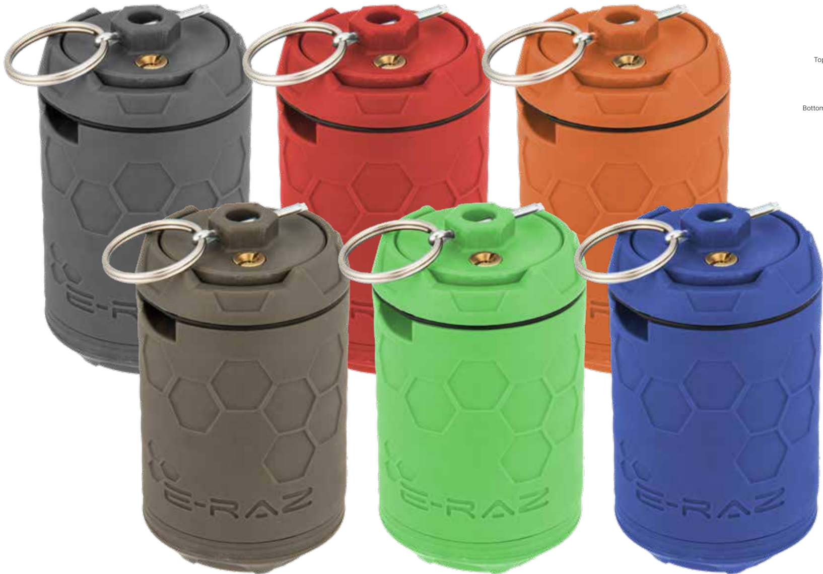
Top row (left-to-right): USLR-A69361G USLR-A69361R USLR-A69361O Bottom row (left-to-right): USLR-A69361V USLR-A69361A USLR-A69361B