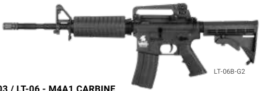
LT-03 / LT-06 - M4A1 CARBINE