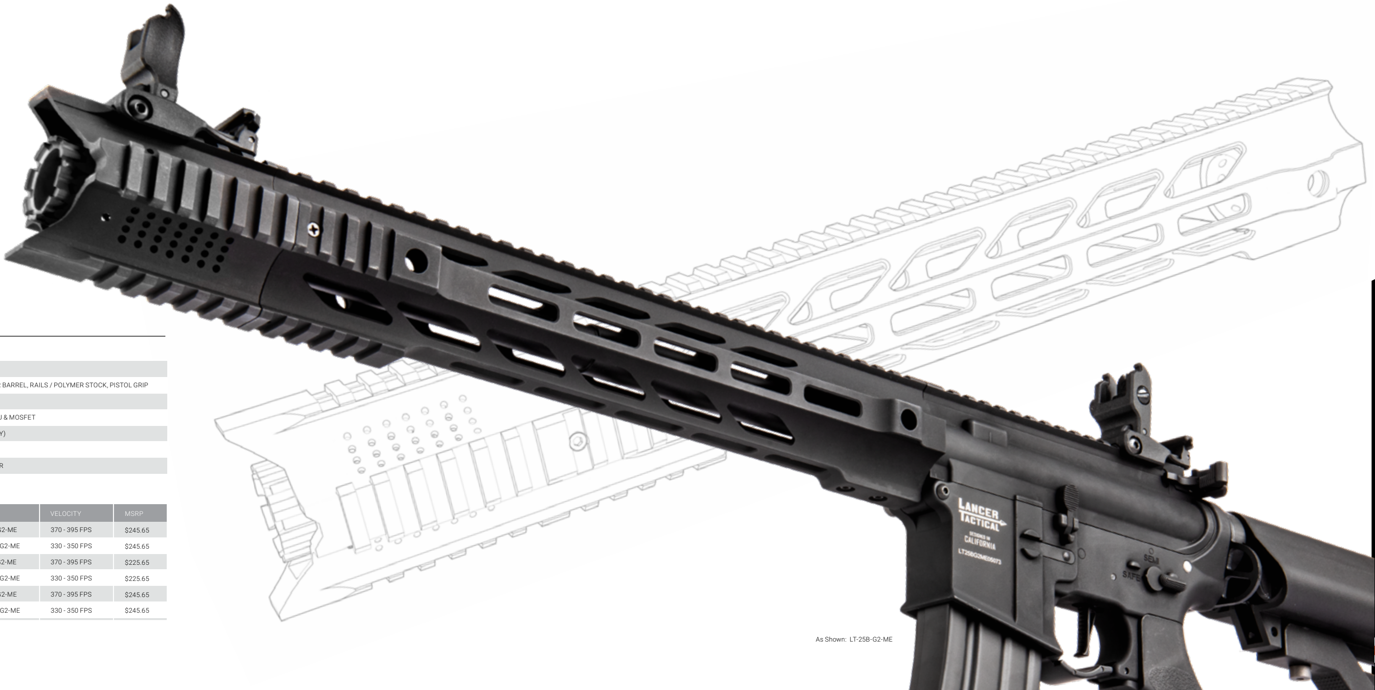
As Shown: LT-25B-G2-ME