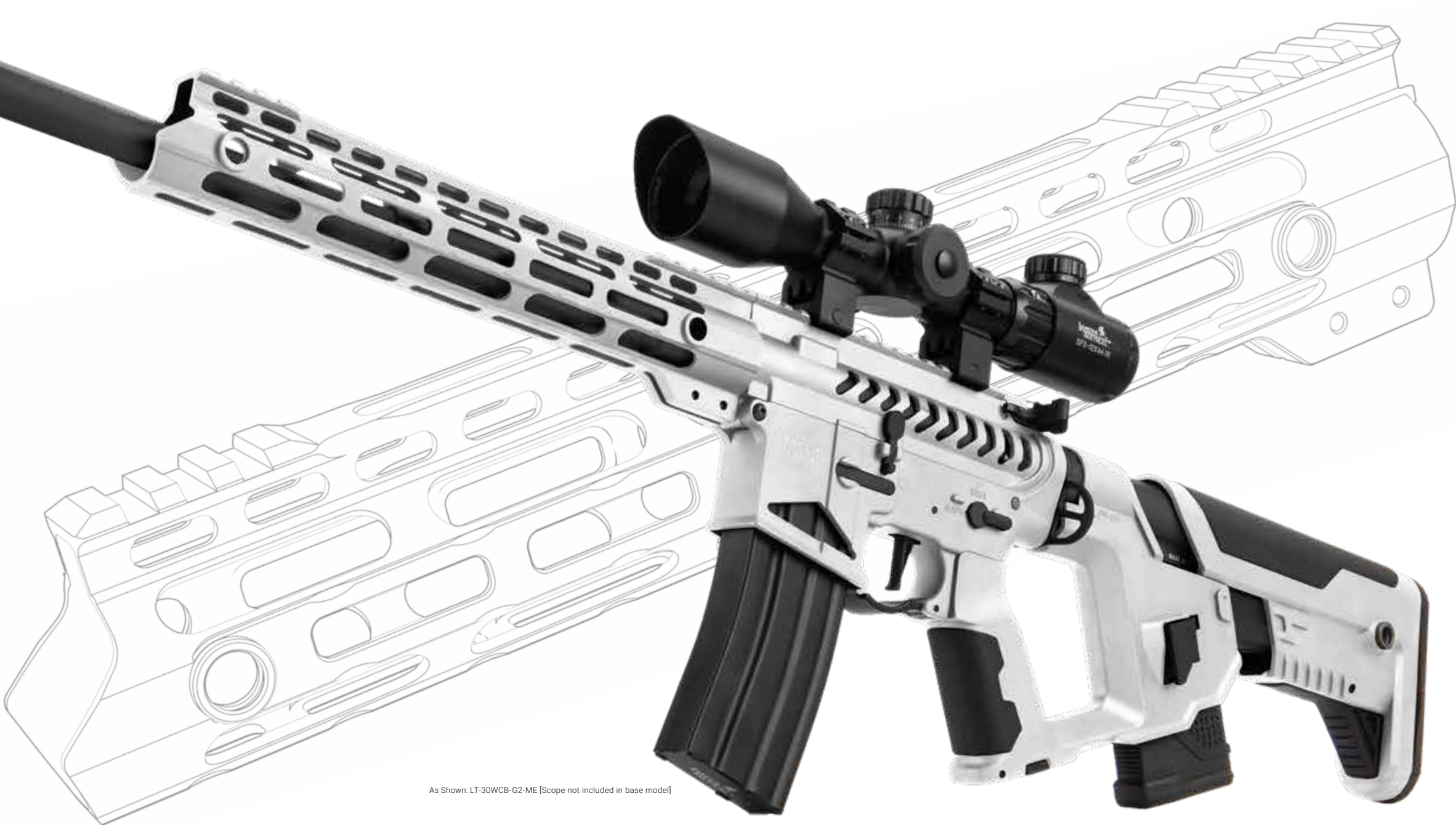
As Shown: LT-30WCB-G2-ME [Scope not included in base model]