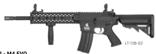
LT-12 - M4 EVO