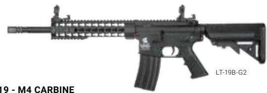
LT-19 - M4 CARBINE