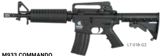
LT-01 - M933 COMMANDO