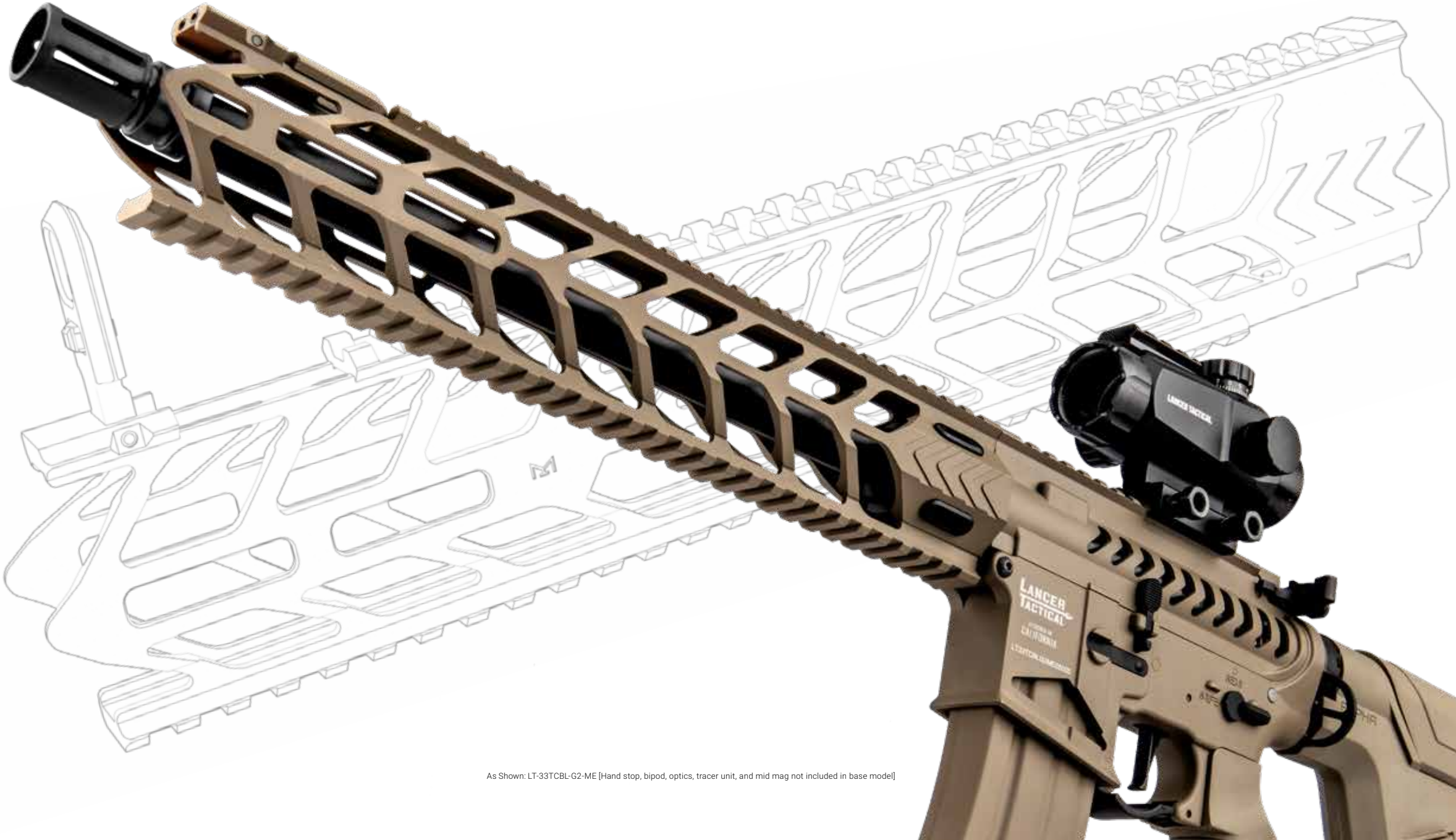
As Shown: LT-33TCBL-G2-ME [Hand stop, bipod, optics, tracer unit, and mid mag not included in base model]