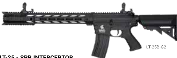
LT-25 - SPR INTERCEPTOR